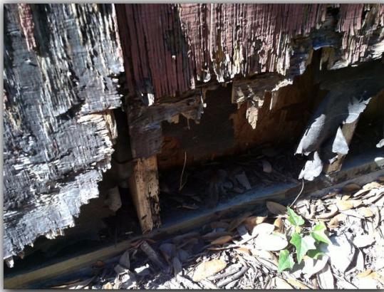
Previous Subterranean Termites - Home