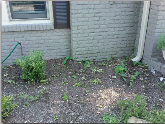
Drywood Termites - Garage